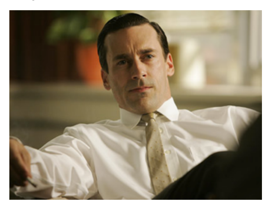
Don Draper, dishing out happiness since 1960.

Don Draper of Mad Men fame stated in one of the series' final episodes that the definition of happiness is "the moment before you need more happiness." As cynical as it is, the brilliance of this line lies in the fact that we rarely notice happiness while we're experiencing it, we only notice a lack of it once it's gone.