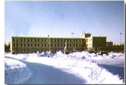
Kenai and Seward RESOURCE LIST

Spring Creek Correctional Center Mile 5 Nash Road PO Box 2109 Seward, Alaska 99664